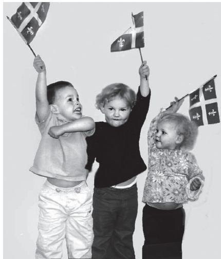
Waving the Quebec fleur-de-lis flag

From July 31 to August 10 Evangelicals will gather in Quebec City to distribute Bibles and other literature for the purpose of drawing the attention of French Canadians to their need for the Savior. BLF and Quebec Hope would love to have you join us in distributing 350,000 Gospels of John and 35,000 New Testaments (Parole Vivante). You do not need to speak French to help with this endeavor. Just giving the Word of God to an unbeliever could change their life for eternity!